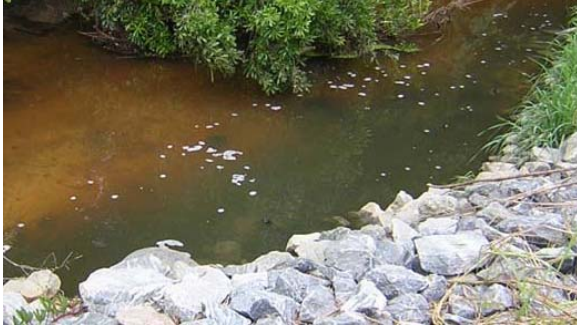
Figure 3 Indicator: floatables

This sensory indicator is a visual observation can usually be seen from a distance making it more noticeable than other indicators (Figure 3). Sewage, oil sheen, and suds are examples of floatables , while trash is generally not.