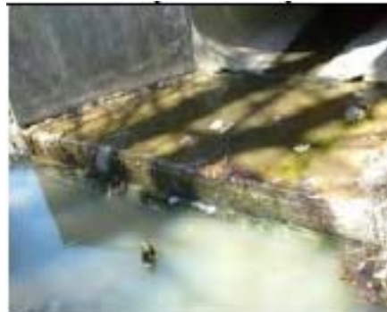
Figure 2 Indicator: turbidity

A sample of the suspect illicit discharge may be collected in a clear bottle, much like color , where it can be scrutinized closely for suspended solids or other sensory indicators. Sometimes turbidity occurs in a scour or plunge pool underneath the outlet pipe. Often the origin of a discharge is not readily apparent, but can be traced by looking upstream for any turbidity plumes.