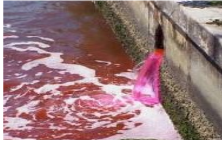
Figure 1 Indicator: color

Color refers to the tinge of the discharge which can be categorized as clear, slightly tinted, or intense on the IDDF. When chemical discharges are present, the entire spectrum of colors is potentially visible: green, red, yellow, blue, white, and even brown or orange are possible (Figure 1). A rainbow sheen floating on the water surface may indicate a petroleum-based discharge (see floatables ). If it can be discerned that the cause of the color is not natural, the physical characteristics should be recorded, and if possible, a sample should be taken. The sample should be captured in a clean, clear bottle and held up to the light so that an accurate judgment about its intensity and color can be made. Many times the source of the discharge can easily be traced by following the color plume upstream.