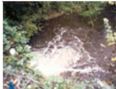
Figure 5 Naturally-occurring suds

Suds can be ranked according to their foaminess and staying power. Thick foam that floats several feet downstream before breaking apart is ranked a three because it possesses both staying power and thickness. Naturally occurring suds (Figure 5) will break up quickly and are generally clear or white.